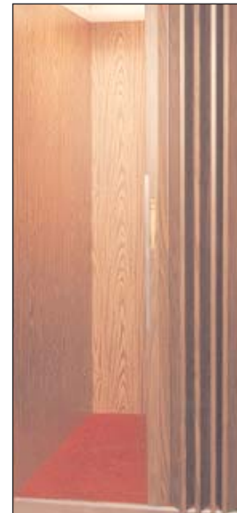
Oak laminate interior with woodfold gate

For more information on the products we manufacturer or pricing, please contact a Sales Representative today at (734) 246-4700 or visit us on the web.