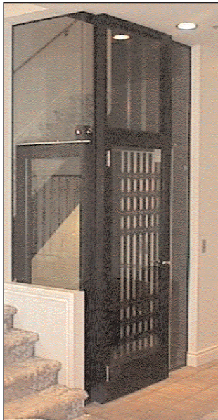
Custom designed glass elevator with Bostwick style scissor gate

No other manufacturer offers a product line this extensive.