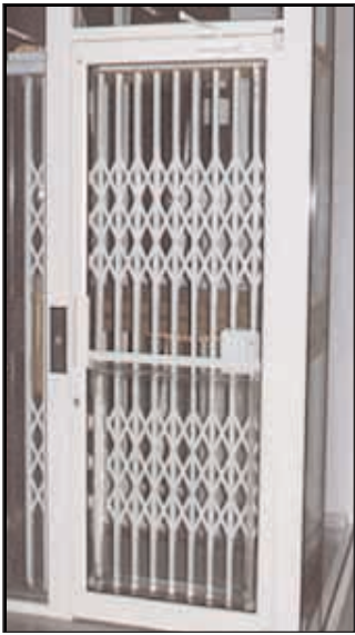
White Bostwick style (scissor) gate