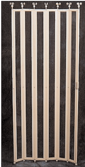
Side Slide Gate in clear acyclic and bronze

Our Side Slide gate is a multi-paneled cab door that turns and slides behind the side cab wall and out of the way, thus providing the widest possible door opening.